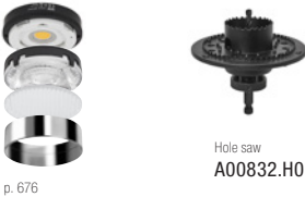
Hole saw A00832.H0