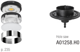
Hole saw A01258.H0

123456. -UL OPTICAL FILTER DECORATIVE RING CCT MODULE FINISH