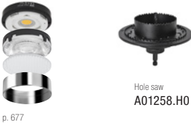
Hole saw A01258.H0

123456. OPTICAL FILTER DECORATIVE RING CCT MODULE FINISH