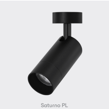
[1] 12° Lens not interchangeable